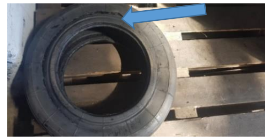
Fig. 3. ER2T 2207-02 damage to the side surface of the ER2T 2207-02 motor car rubber cord

Replacement of the cord coupling according to the repair rules L31/97 [4] should be carried out during the type TR-3 periodical repair in October 2019. The car, after being repaired in the volume of TR-3, was put into operation on October 29, 2019, but already on July 20, 2020, while performing type TA-3 maintenance, a rupture of the side shell of the rubber-cord coupling was noted.