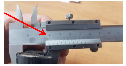
Fig. 6. Result of measuring the side surface of the coupling at the fastening place

Also, when measuring the side surface of the coupling, it was stated that at the point of attachment of the rubber-cord coupling to the flanges, where the traction force is transmitted from the traction motor, the coupling shell has the smallest wall thickness. According to the measurement results, the side surface of the coupling has the smallest thickness, which was 19.4 mm, Fig. 6.