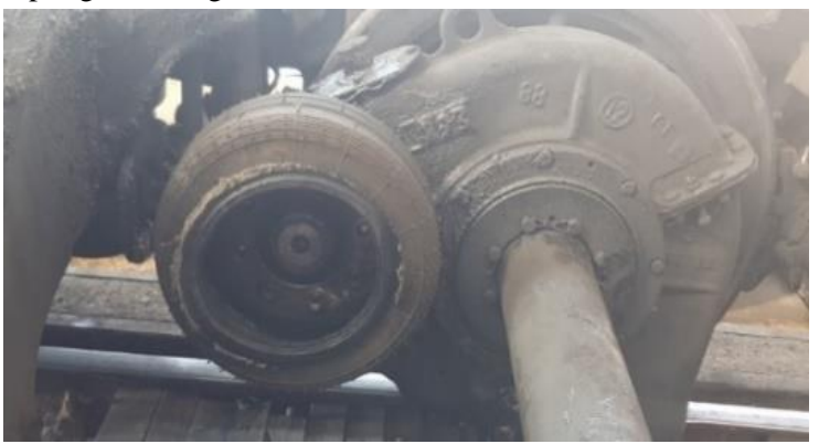
Fig. 1. ER2T car rubber-cord coupling side surface damage

At the company JSC "Pasažieru vilciens" operating on the Latvian Railway, the second most important reason for unscheduled repairs of ER2T series EMU train motor car traction gears is the failure of the rubber-cord coupling shell, Fig. 1.