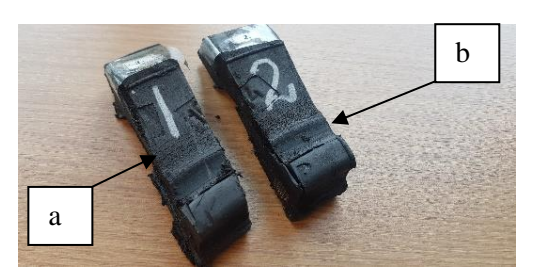
Fig. 8. Samples for determining the influence of temperature and the action of the lubricant: a - Sample 1, b - Sample 2

To study the effect of MOL Alugear LKP 000 lubricant, tests were carried out to determine the hardness of rubber-cord couplings sample 1 and sample 2 (Fig. 8) in the chemical laboratory of the RTU. Also, studies have been carried out on the temperature effect on the shell of the rubber-cord coupling [8].